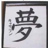
Complete your art