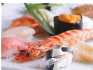
▲ The photo is just a sample and subject to change according to the season and availability.