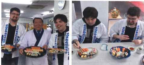
◀ The photo is just a sample and subject to change according to the season and availability.