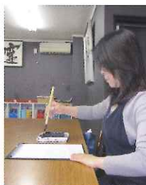
Concentrate on your writing. Express beauty of lines.