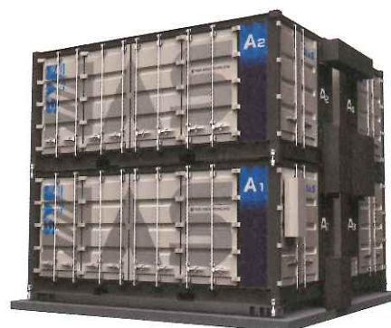
Container-type NAS battery

NAS batteries are made of sodium, sulphur and NGK's proprietary beta-alumina ceramic, all of which are recyclable. "High quality, low cost and dependable performances are all essential for widespread deployment of grid storage. We have achieved these capabilities thanks to beta alumina, which we devel-