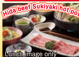
Lunch image only

After having lunch, there will be free time in Takayama