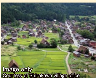
Image only